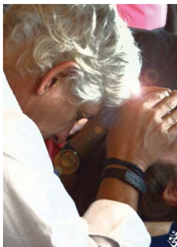
Annual Teachers' Gathering