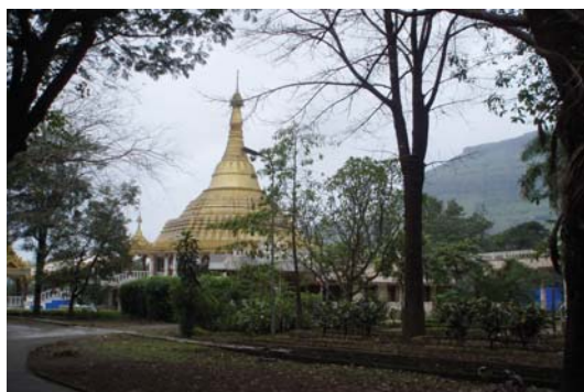
Dharma Giri, Vipassana centre, India

2011 was not only intense, it was also busy. A year full of classes, treatments, voluntary practice, the Shoalwater retreat, practitioner and teacher gatherings, and promoting Reiki through the endeavours of the Reiki Association (WA) and the Reiki Practitioners Council of WA. As standards of training are fundamental to the standard of practitioners, there are significant programs to improve the quality and consistency of training to be implemented in 2012. It was also an immensely rewarding year for voluntary practice; in one instance, 70 parents of children with disabilities were provided with treatments, an incredible – and much appreciated – effort. The final report of the Health Care Complaints Commission's review of the "Codes of Practice", has yet to be released, but when it does, it will affect all complementary health practitioners who work in public.